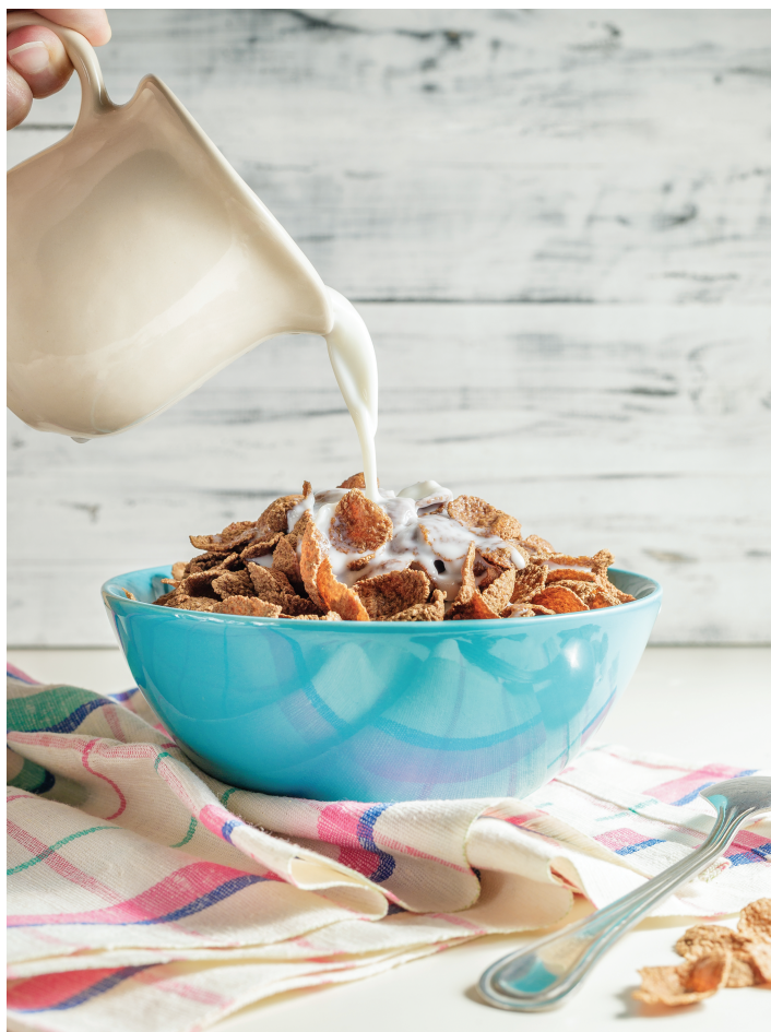
Figure 2. The calculated digestible indispensable amino acid score (DIAAS) value of a mixed meal of 60% milk and 40% wheat based breakfast cereal is 107, demonstrating the ability of milk to complement wheat resulting in a balanced meal that provides 100% of human AA requirements.

individual ingredients are calculated by first determining the standardized ileal digestibility of each amino acid in a food protein. This value is then multiplied by the concentration of that amino acid in the protein to calculate mg digestible amino acid per g protein. A digestible indispensable amino acid reference value is then calculated for each amino acid by dividing the concentration of digestible amino acid by the reference value for a specific age group. The DIAAS value is subsequently determined as the least value among the digestible indispensable amino acid values for the digestible indispensable amino acids (Figure 4).