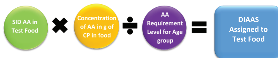
Figure 4. Steps in calculating digestible indispensable amino acid score (DIAAS) values. First, the standardized ileal digestibility (SID) of amino acid (AA) in the test food is determined in the human, pig, or rat. Then, this value (SID of AA in Test Food) is multiplied by the analyzed concentration (mg) of the same AA in a g of crude protein (CP) for the test food. Lastly, the calculated mg SID of each AA per gram of CP is divided by the same AA requirement level for a specific age group. This results in a calculated digestible indispensable AA (DIAA) reference value for each AA and the AA in least concentration is the DIAAS value assigned to the test food.